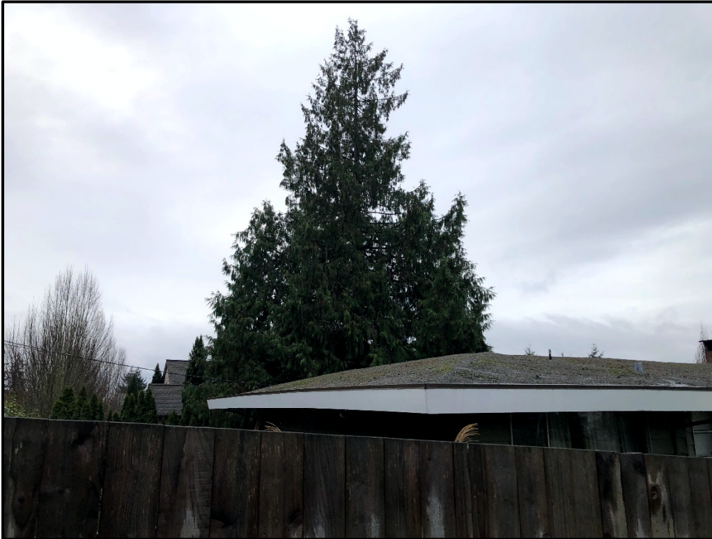
Photo 1. Looking southwest at tree 267