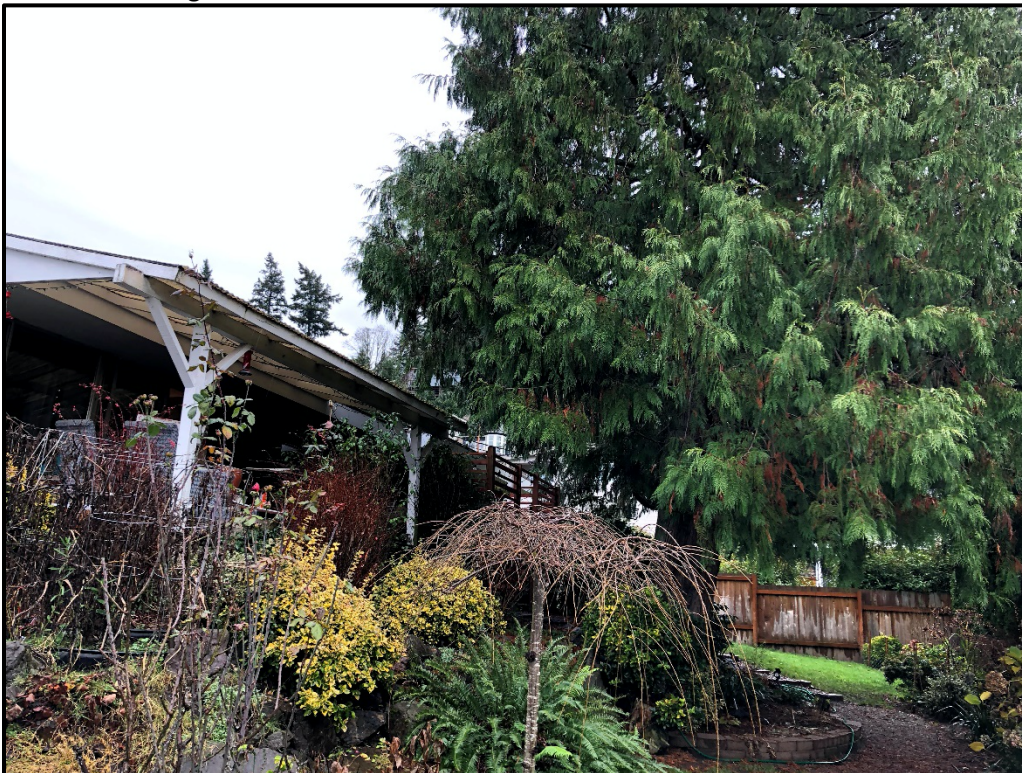
Photo 2. Looking east at tree 267, the tree is growing on a gentle slope and overhanging the existing structure.